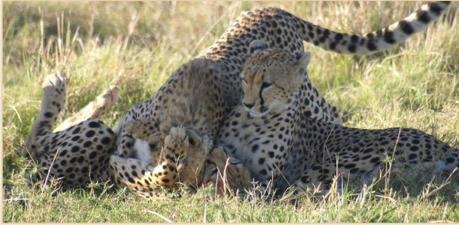
Cheetahs at play in the Koiyaki area

pictures for addition to our “In and Around Ol Seki” online gallery – coming soon.