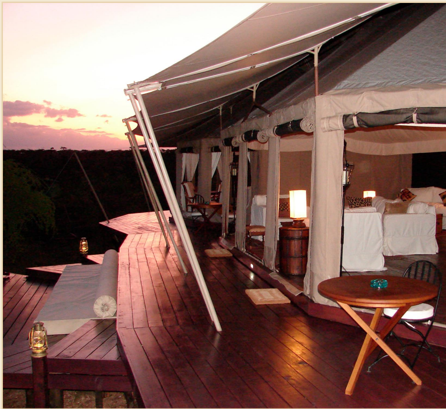
The Simba Suite at Sunset

Further to the addition of the Suites, each of the 6 Nina tents have been fully refurbished along with the library and dining tent in the main area of the camp, whilst the main kitchen has had a complete face lift.