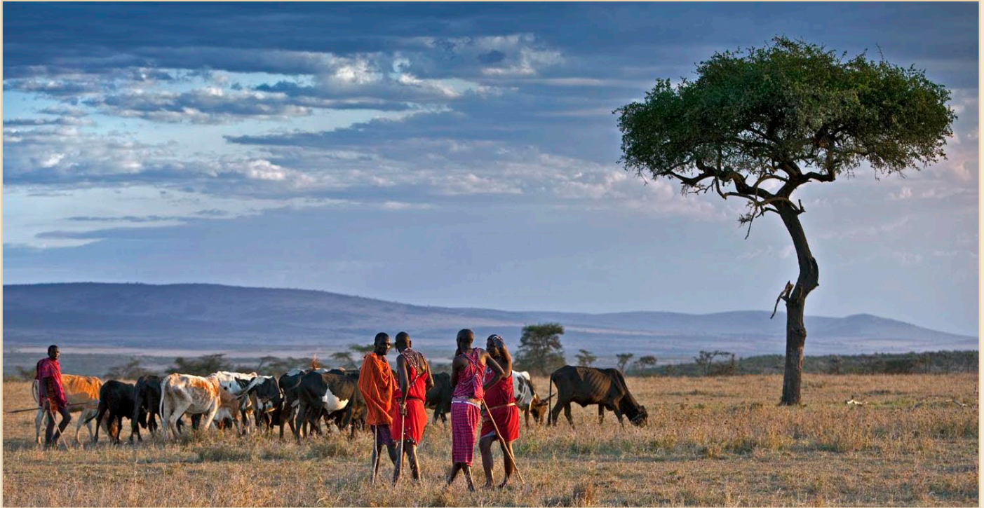
Maasai herding their cattle

the children. The school now has five classrooms and a pre-school unit. They are looking to build at least another three classrooms in conformity with Kenya's 8:4:4 system. Ol Seki would welcome any donations channelled through Tusk Trust. A few years ago a free primary education scheme was started in Kenya. The budget for each student per year is 400 Kenyan Shillings - just over 3 pounds/$5USD. This is to cover teacher salaries, materials and texts. The government does not give money for building schools so often you will find classes taking place under the not-so proverbial acacia tree!