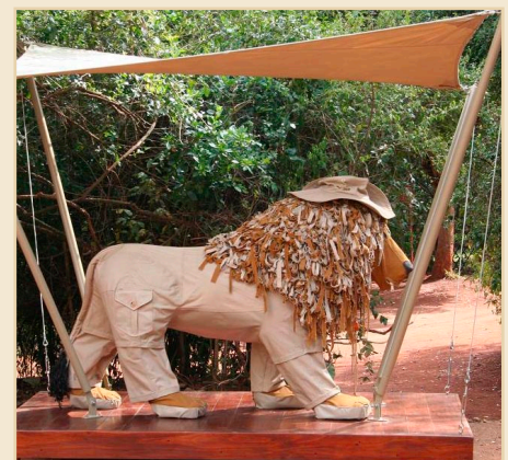
The Ol Seki Born Free Lion

For more details on the community work of Ol Seki please visit http://www.olsekicom/community/